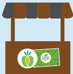
FARMERS MARKETS & PRODUCE STANDS

Ask how the SNAP-matching program works at a participating location near you.